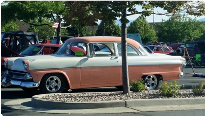
Little Sister 1955 Customline Ford