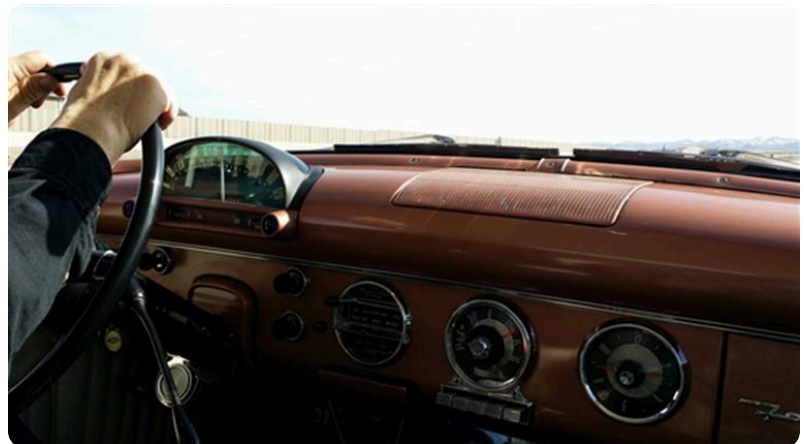
Hands on the wheel. Cruisin' in the '55 Ford.