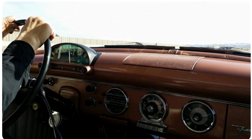
Hands on the wheel. Cruisin' in the '55 Ford.