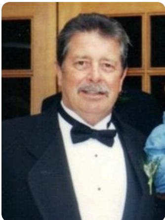
Handsome dapper gentleman.