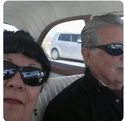
Cruisin' on a Sunday afternoon.