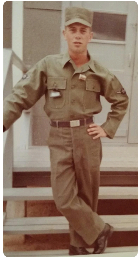
US Air Force 17 yrs old